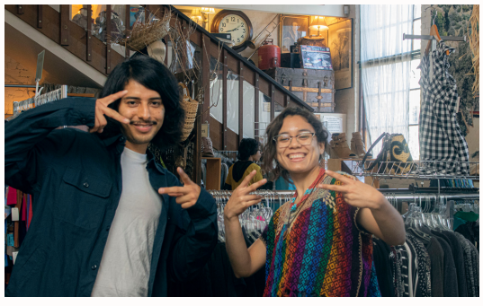
Behind the scenes of "Punk is Punk" by Artevista Films.