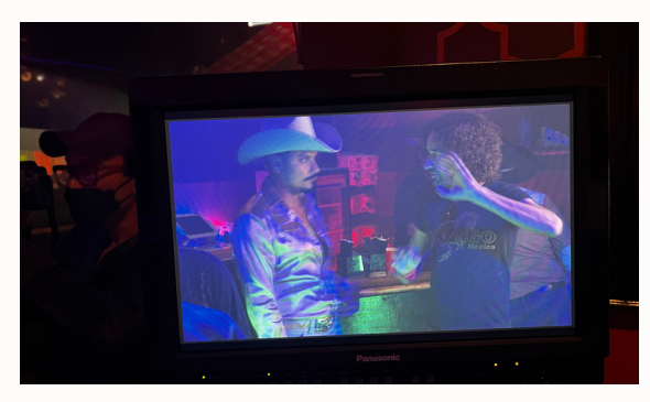
Behind the scenes of El Paisa by El Paisa Film, LLC.